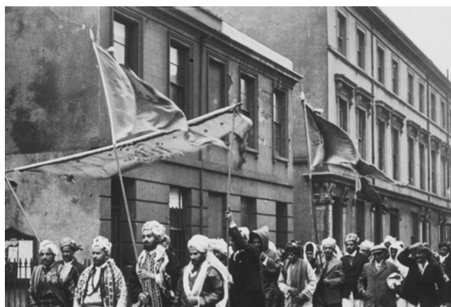
Pilgrimage to Mecca procession, 1938